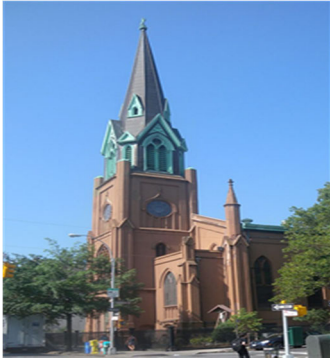
St. Paul Church