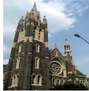
St. Agnes Church

*English and Spanish are spoken at each parish office. Se habla Ingles y Español en cada oficina parroquial