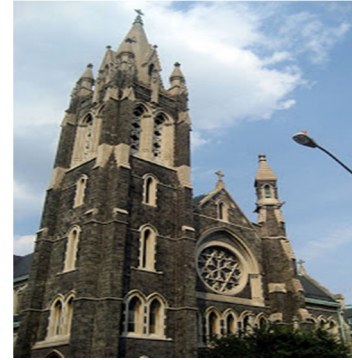
St. Agnes Church

*English and Spanish are spoken at each parish office. Se habla Ingles y Español en cada oficina parroquial