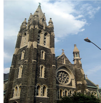
St. Agnes Church

*English and Spanish are spoken at each parish office. Se habla Ingles y Español en cada oficina parroquial