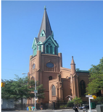
St. Paul Church