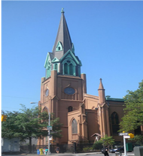
St. Paul Church