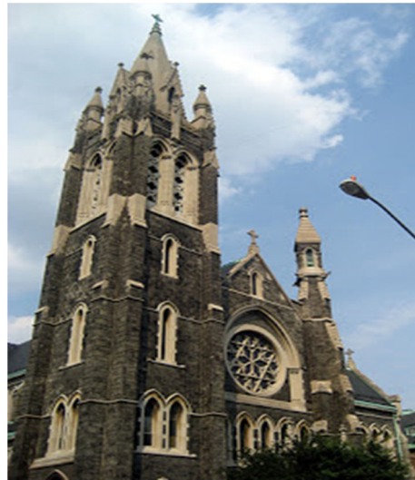
St. Agnes Church